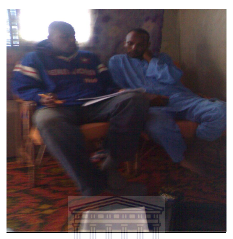
Photograph 5: Working session with key informant from the Fulani community