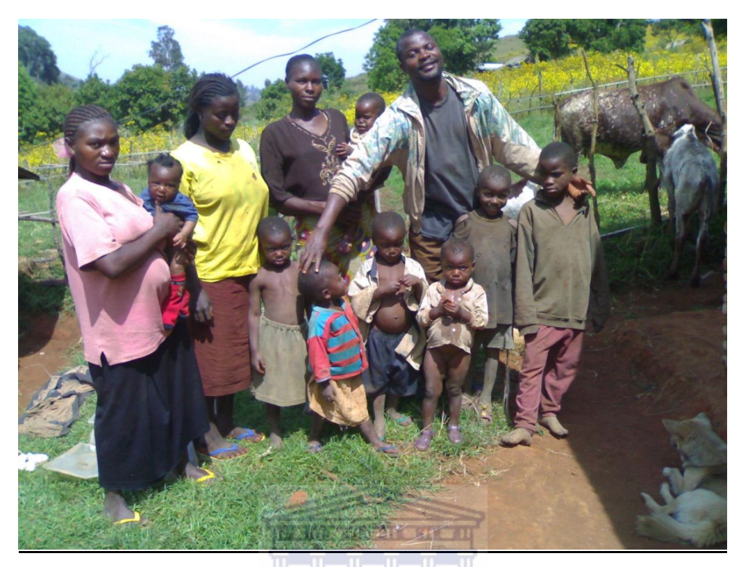
Photograph 3: Typical cropping household in Small Babanki (farmer, 3 wives and 8 children)