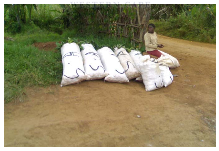
Photograph 2: Bags of huckleberry ready to be transported to the market