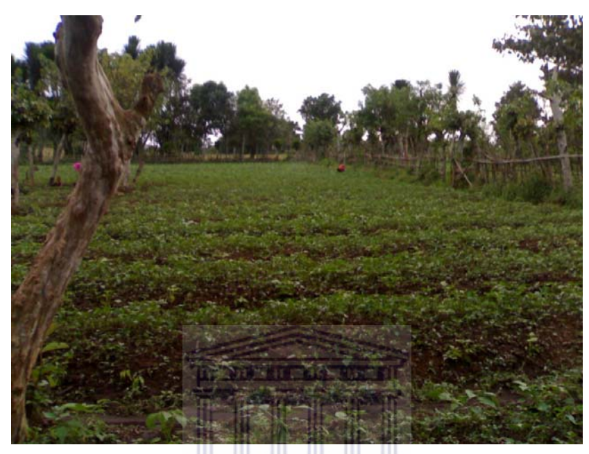
Photograph 1: Huckleberry under cultivation within a paddock