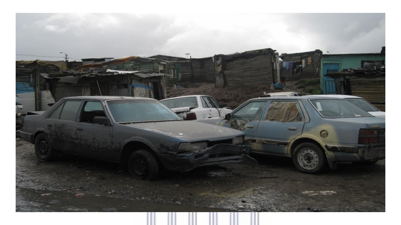
Figure 5: The Kanana informal settlement in Gugulethu

Gugulethu, like other South African townships, is faced with social challenges, these include; poverty, crime, disease, unemployment and xenophobic attitudes, amongst others. For example, available research for the area showed that 60% of the people aged 15 to 49 of the area were employed, only 58% of households in the area have access to piped water in their home, and households living in formal dwellings are 52% (Statistics South Africa, 2013).