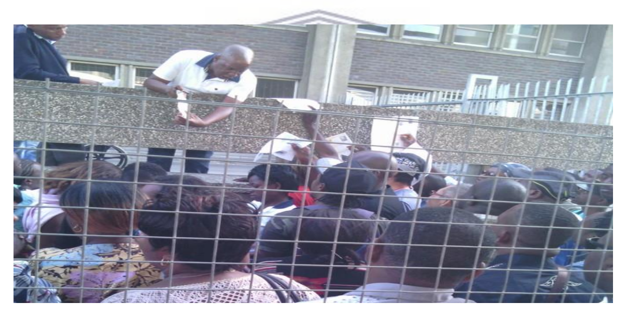
Figure 13: Situation at the Cape Town Refugee receiving Centre

Above is a picture of a Cape Town Home Affairs showing the influx of migrant waiting in the queue while waiting for an official to collect migrant's documents to be renewed