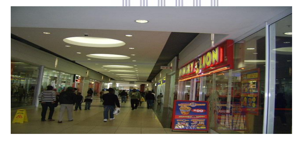
Figure 4 Gugulethu Square mall showing different shops

Although, Gugulethu has in recent years improved, there are still some informal dwellings. In these informal settlements, in particular, sewage runoff has created streams that run parallel to some of the roads. Where there are small clearings, these serve as places for garbage disposal, which has accumulated over a period of time. At frequent intervals between the