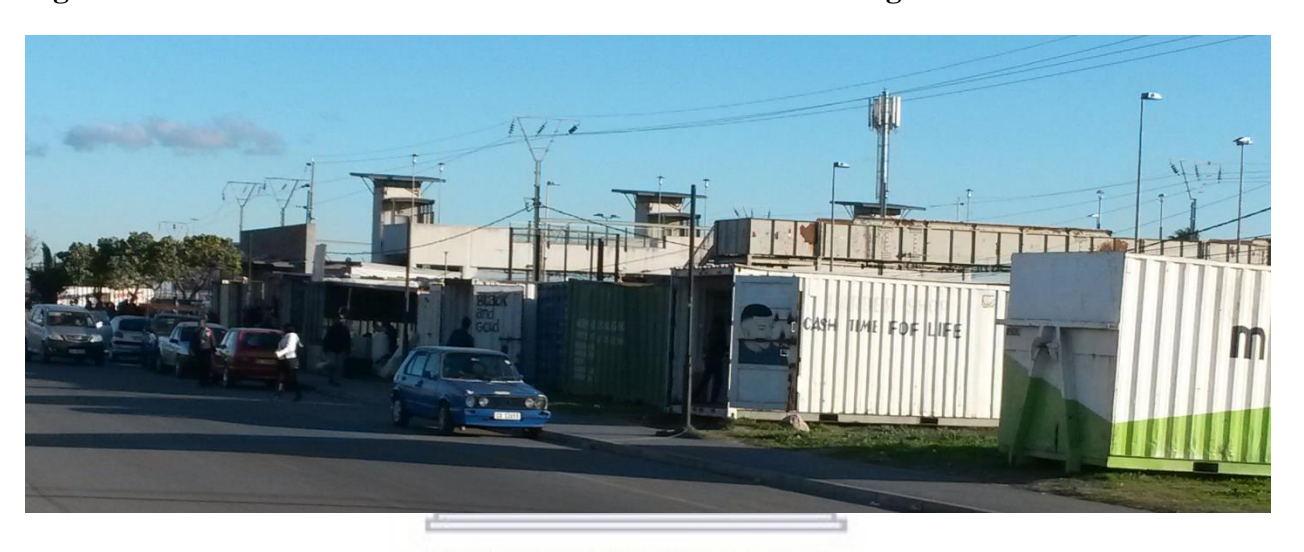
Figure 8: Small Business Centre at the Heideveld Station in Gugulethu

Above is a picture taken by the researcher in Gugulethu showing informal small businesses established and operated by migrants indicating the economic integration in the community of Gugulethu.