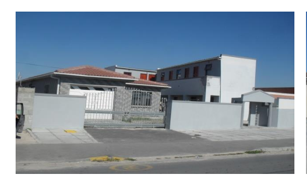
Figure 9 and 10: Pictures taken by the researcher at Luyoloville (next to Heideveld train station) in Gugulethu.