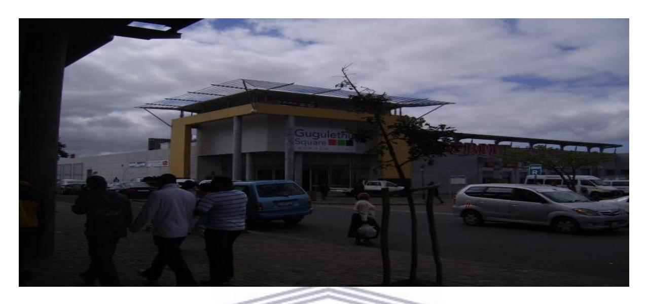
Figure 3 Gugulethu Square mall from outside

Above picture shows Gugulethu Square mall from outside.