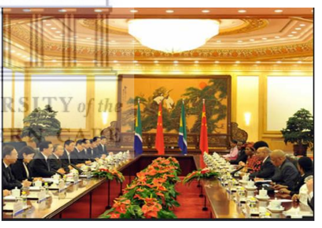
Image 6: South Africa and China in formal dialogue during state visit in Beijing, China.

Zuma in his opening remarks referred to China as "friends" of South Africa. The word choice is an essential element to the outcome and interpretation of protocol. This description indicates an already established, mutually beneficial relationship (Wijers et al., 2019). Zuma makes it clear that the relationship between China and South Africa is already established and is a long-term relationship.