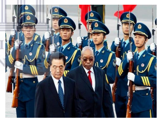
Image 5: President Jacob Zuma ( right ) and President Hu Jintao from China ( left ) during the welcome ceremony during President Zuma's visit in Beijing, China.

The protocol around the arrival of guests during a state visit should include transport from the airport to accommodation, which is the physical starting point of a protocol for a state visit. This is to ensure that security in the visiting state for the president is not a challenge. It saves time for