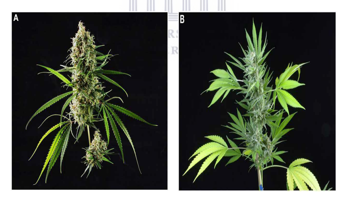
Figure 2.2: Medical Cannabis cultivars grown in the UK by GW Pharmaceuticals (Adapted from Clarke & Watson, 2002). A The larger inflorescence is a CBD-rich cultivar containing only traces of THC. B is a THC-rich cultivar containing only traces of CBD.

This study will mainly focus on the Cannabis sativa species, especially exploring the CBD compound.