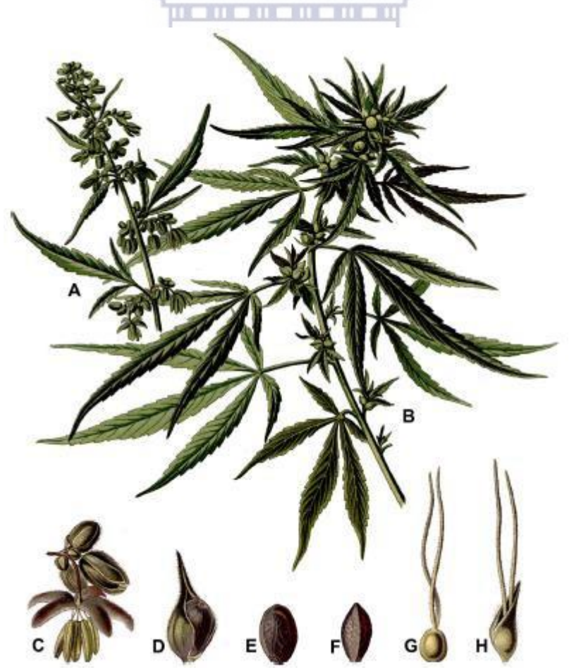
Figure 2.1: Painting of Cannabis sativa from Köhler (1887). A Flowering male

The cannabis plant belongs to the flowering family Cannabaceae , with the genus Cannabis and sub species. Domestication of the cannabis plant for human use has led to conflicting evolutionary interpretation and classification of cannabis. Small (2015) recommends that cannabis must only be classified as Cannabis sativa L. while other sources categorise the four species as C. sativa , C. indica , C. ruderalis and C. afghanica (Clarke & Merlin, 2013). A representation of male and female plants is shown in figure 2.1 below.