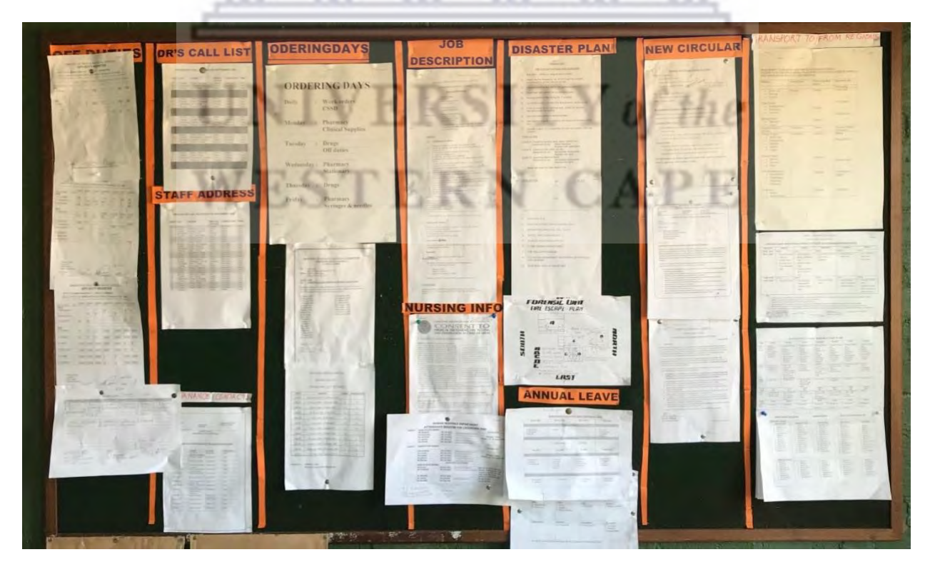
A notice board in the rehabilitation ward of the Forensic Unit

A list of procedures is pasted on a wall in Ward C and a notice board in the forensic unit below.