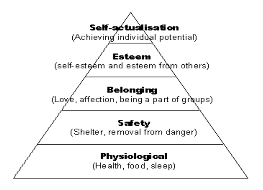
FIGURE 1: MASLOW'S HIERARCHY OF NEEDS (SOURCE: KREITNER, 1998)