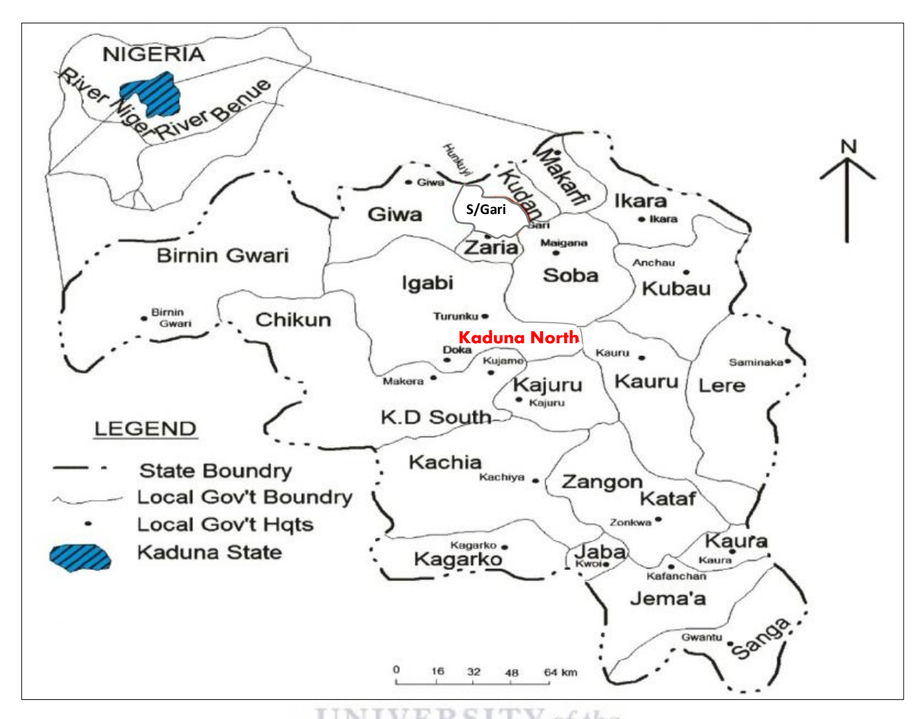
Figure 2: Map of Kaduna State