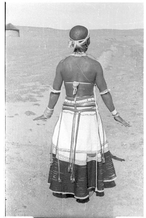
Figure 1-5. Transkei: The Chic witch doctor and admirers.