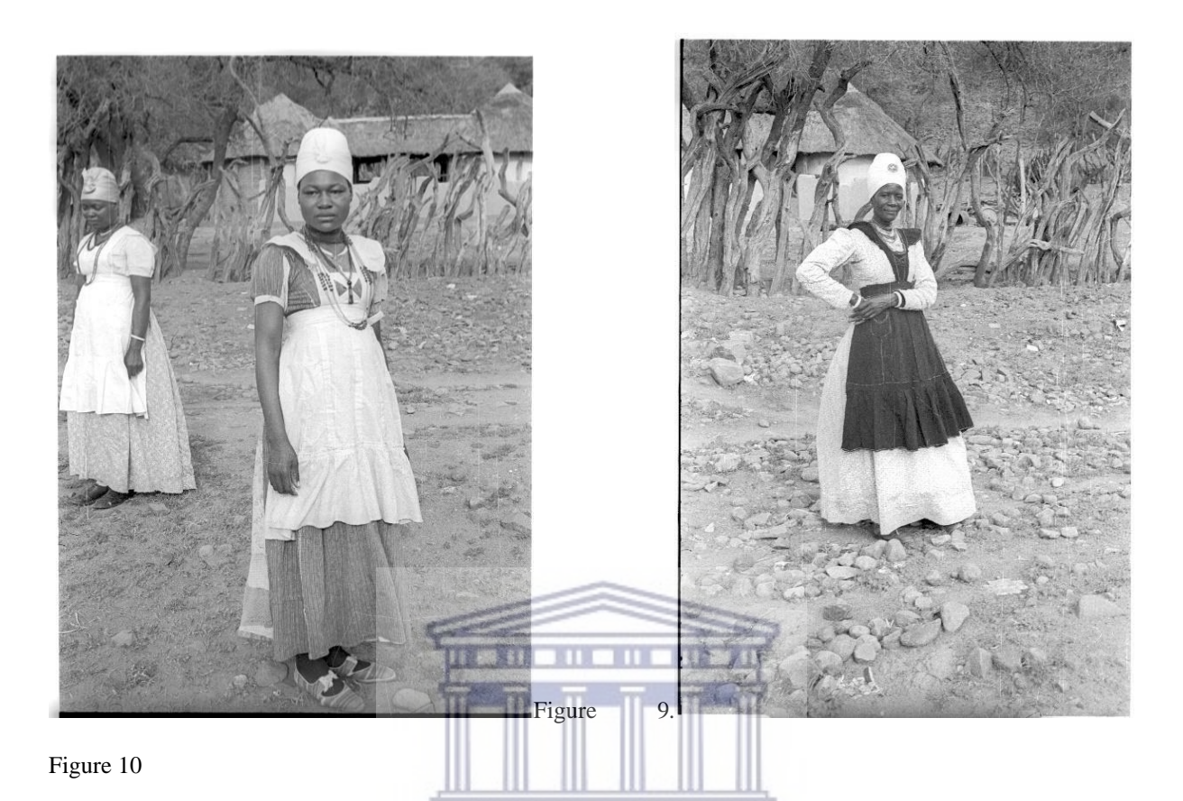
Figure 9-10 Bechuanaland: 12-16 January 1947.