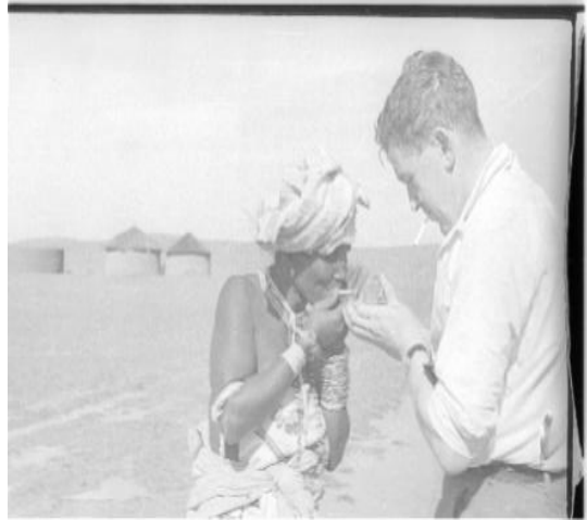
Figure 6 Figure 7