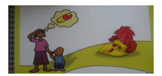
Figure 3. Caregiver forgets ART Dose for Adolescent.

From this study, both caregivers and adolescents reported that forgetting the taking of ART doses remains significant among adolescents.