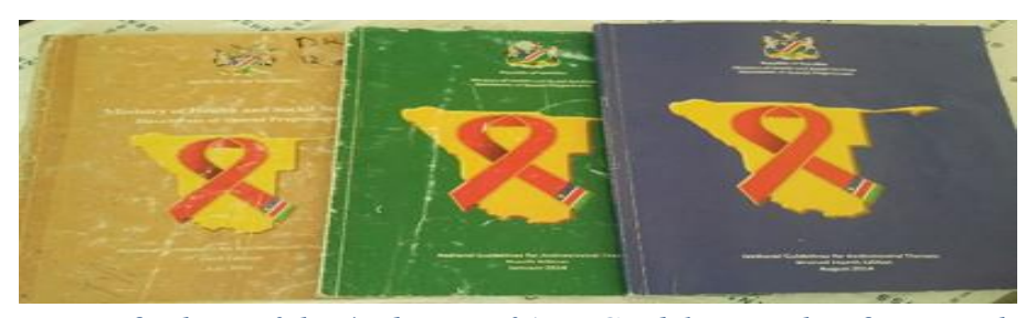
Figure 6. Three of the 4 editions of ART Guidelines within 6 years. Photo by Eliphas H, 2015

As new regimens being developed or improved to address most of the identified gaps, some health care workers do not capture or understand these changes and they continue giving health education and counselling based on the older versions of dosage instructions which become obsolete information, confusing and causing adolescents not to stick to the correct dosages and sometimes they discontinue taking medicines altogether.