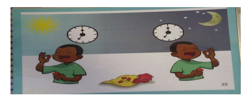
Figure 7. Outdated Dosage IEC Material in use for Adherence Counselling. MoHSS, Pepfar & I-Tech, 2012

Likewise, if the patient or caregiver is not familiar with the new dose or medicine, they may administer it at wrong times, missing the peak hours of maintaining the blood drug level. The findings from this study are in agreement with Reda and Biadgilign (2012) that poor adherence among adolescents can be caused by medication patterning challenges, lack of directions and public education.