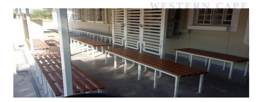
Figure 4. Patients Waiting Benches at Pharmacy for Long queues.

Long waiting queues which are common in Onandjokwe ART clinic especially at pharmacy lead to caregivers or adolescents to develop impatience, irritability and loss concentration during both routine and special adherence counselling sessions, resulting in poor understanding of details of medicine taking and eventually, adhere poorly to ART medicines. Similar findings are cited by Dahab et al. (2008) who indicate that long waiting times in health facilities discourage patients to visit ART clinics to collect their ART medicines.