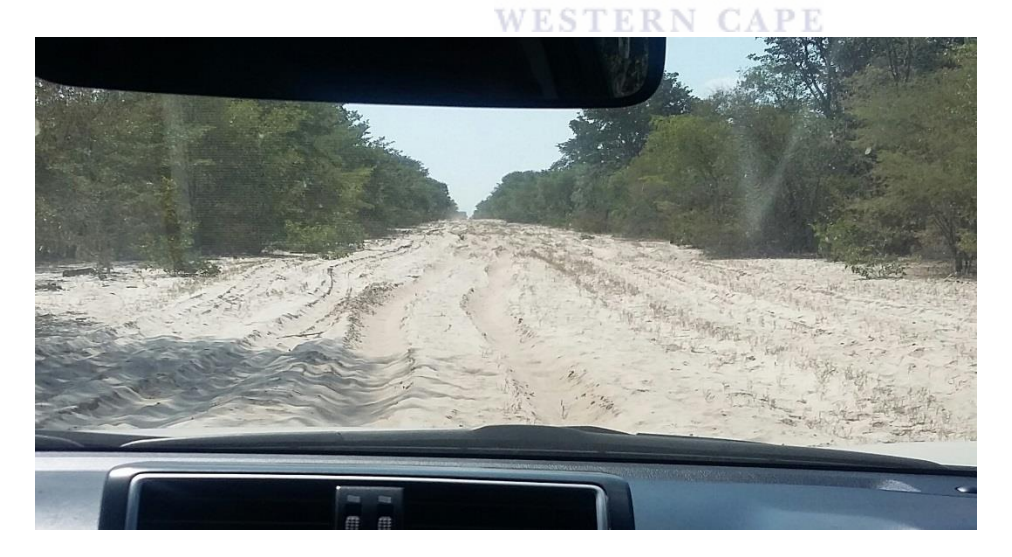
Figure 10. Loose Sandy Road Tracks in Dense Forests of Onandjokwe District. Photo by Eliphas H, 2015

The major part of Onandjokwe District is a hard to reach area, characterized by dense forests, long walking distances, loose sand and sandy road tracks (shown in the picture below), making it difficult to find vehicle transport.