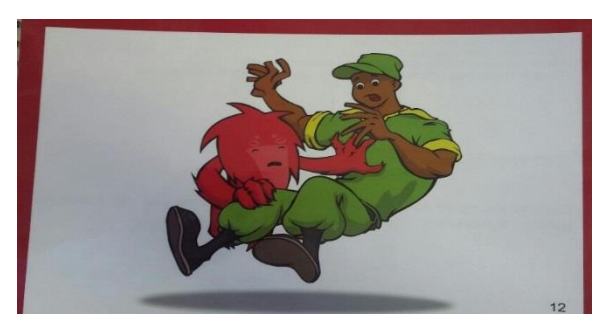
Figure 9. Famous Picture used for Adolescents Disclosure Program.

The high staff turn-over that was experienced in Onandjokwe has negatively affected the Teens' Club service delivery, Adolescents Friendly Club Days and Adolescent Disclosure Programs.