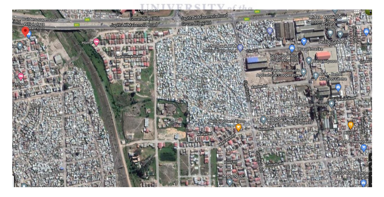
Figure 2; Aerial image of Ramaphosa as a community

The Big Five was established during the invasion and was responsible for the allocation of land to residents. Initially, each resident was allocated a piece of land of a size of 10x10 meters but when more and more people started coming in the size of the land decreased from 10x10M to 7x7M and finally to 5x5M. The process of getting a piece of land was fairly easy, residents had to bring their building material. Register with the Big Five members, they would be allocated a piece of land, they would have to mark it with four (or more) poles or rocks, to indicate where the boundaries of their land were.