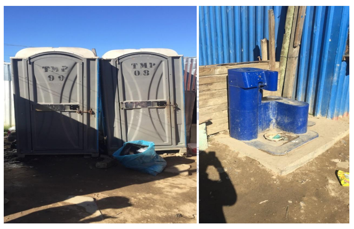
Figure 4: Government installed taps & Mshengu's (portable toilets)

According to community leadership, this is a step in the right direction, the City of Cape Town is starting to respond to them, and that makes them satisfied. To the Big Five, the city installing these toilets signals the start of a partnership between the community and the city in the same effort of improving the lives of the poor. But the residents were aware that the local government (City of Cape Town) had used this 'tactic' before and it is a way of silencing them. According to one of the residents who previously lived in a TRA (Temporal Relocation Area) in Delft, "The City of Cape Town does this when it wants to silence communities, it gives you portable toilets in the name of development" (Zusiphe, 2020).