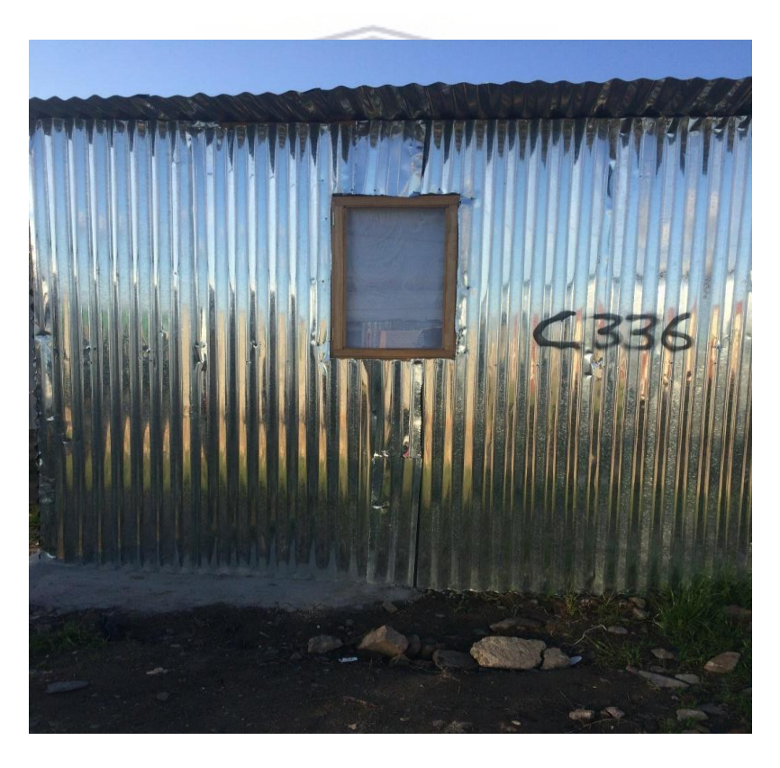
Figure 3: One of the houses marked by the residents, with a marking spray.

The idea of numbering the houses is a way for the leadership committee to know how many households they represent to the local government. "This is done by the leadership so they can know how many people they represent when talking to the City" (John, 2019). This was also done in an attempt to make the community much more organized, the leadership structure wanted to know who the people living in the community are. This was creating a register, when they were collecting the R20 for water-tap this made it easy to identify the houses that paid the amount.