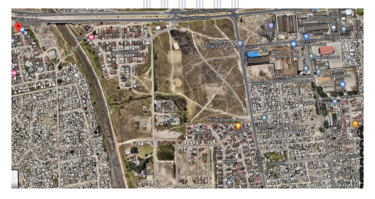
Figure 1: the location of the land before it was invaded.

The image below is an aerial Google maps image of the land that came to be known as Ramaphosa. The image was taken before the land invasion; there are no structures on the land. However, the land is surrounded by a number of communities, such as; Siyahlala, Hazeledene and Gugulethu. From the aerial photograph you can see footpaths, and that is a result of people using the land as shortcut to the train station, bus stop and to catch taxis known as "Amaphela" along the main road.