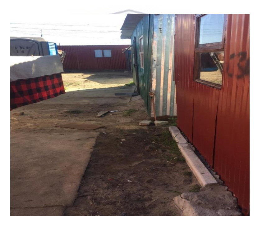
Figure 3: Water taps installed by the community

Because the community is on unserviced land with no municipal services the Big Five and residents had to come with short-term solutions for the problem of no water, toilets, and electricity. One of the solutions was "There are no facilities in place, but as residents to put R20 together and connect our tap for running water" (Zusiphe, 2019). Each household in the community contributed R20 to buy pipes to connect to the nearest water source. Although this is illegal, it is one of the strategies that the community has come up with to gain access to services.