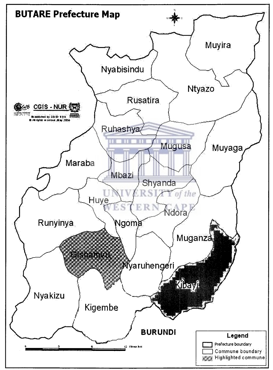
Map 2: Butare Prefecture Administrative Map