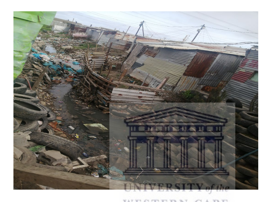
(Siyanyanzela informal settlement,2021)

comprises mostly of shacks with no or little basic services. The picture below was taken as an example to support the statement above on socio-economic divide in the area. As noticeable in the picture below there is houses behind the shacks which is middle income areas.