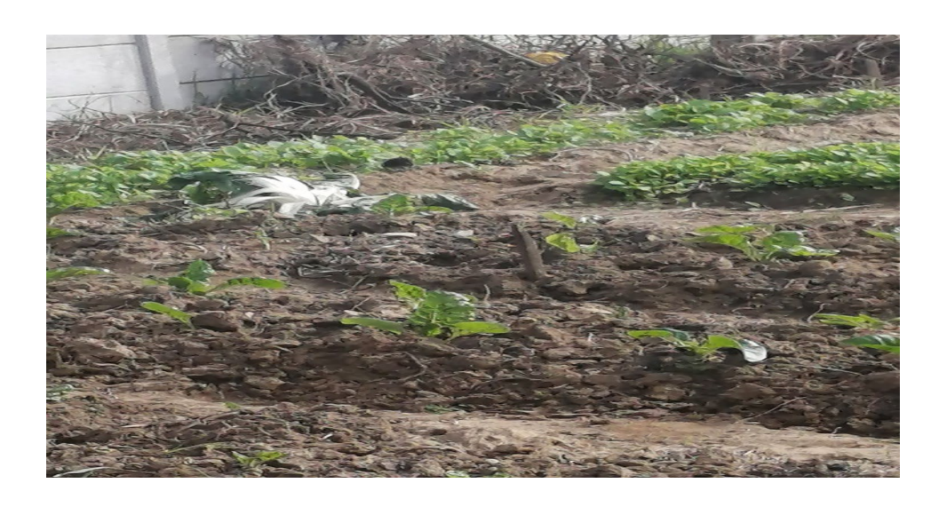
Figure 4.3.1 Types of Businesses

(Siyanyanzela Informal Settlement, 2021).