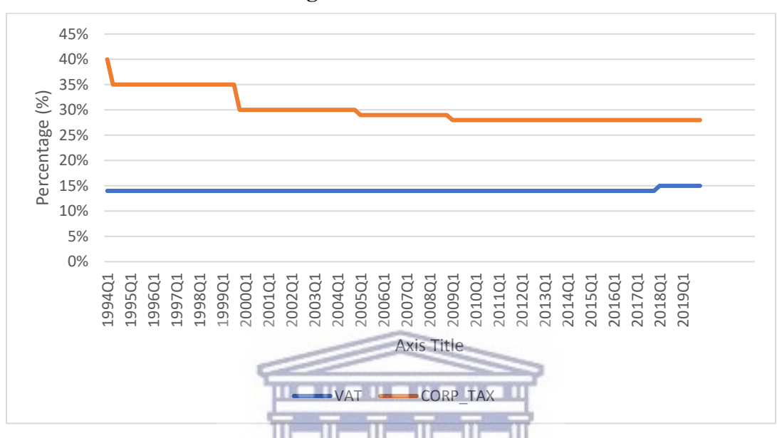
Figure 1. 3: Tax rates

Subsequently, public infrastructure spending recorded a consistent decline after 2016. Private infrastructure spending was immediately impacted by the 2008 financial crash, causing a significant reduction in infrastructure spending between 2008 and 2011. Public and private infrastructure spending are yet to return or exceed the pre-financial-crash levels, as shown in Figure 1.2.