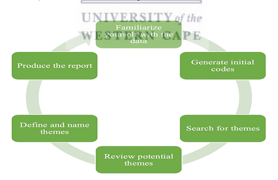
Figure 7: The continuous cycle of thematic analysis (adapted from Braun & Clarke, 2006, 2012)

Thematic analysis can be used to obtain and understand people's viewpoints (Braun & Clarke, 2006; King, 2004), personal knowledge (Kiger, 2020), perceptions, understandings (Herzog et al., 2019), thoughts, lived experiences and behaviours in data analysis (Kiger, 2020). Thus, thematic analyses "seek to theorize the sociocultural contexts, and structural conditions, that enable the individual accounts that are provided" (Braun & Clarke, 2006, p.85). Thematic analysis was not chosen for this study because it is an "easy-to-follow method of analyses" (Kiger, 2020, p.2). Instead, it was chosen specifically for this study because it fits with the goals of this research study (Kiger, 2020). Meaning, Thematic analyses was appropriate for this study as it used a smaller-sized group (Herzog et al., 2019). Thus, this study made use of a smaller sample group (6 learners and 3 teachers) for the data set and seeked to understand people's thought processes, behaviours and experiences while collecting data (Braun & Clarke 2012). Many researchers describe a guide to using thematic analysis (Javadi & Zarea, 2016; Alhojailan, 2012; Boyatzis, 1998), but for this study, I used Braun and Clarke's (2006) thematic analysis method, used within qualitative works (Clarke & Braun 2017), which consists of six steps.